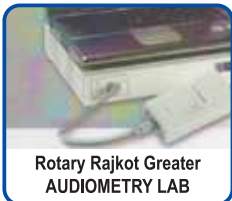
Rotary Rajkot Greater AUDIOMETRY LAB