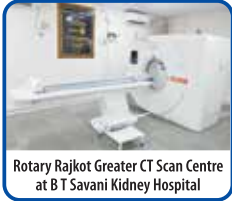
Rotary Rajkot Greater CT Scan Centre at BT Savani Kidney Hospital